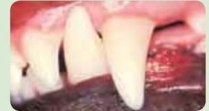
(1) Healthy mouth