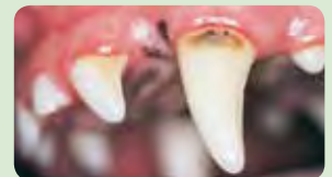
(2) Gingivitis – with early calculus